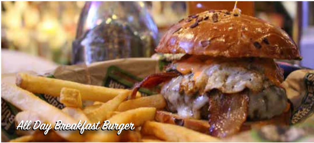
All Day Breakfast Burger

BURGER BRUNCH SERVED LIMITED EDITION SUNDAYS • 11:30AM - 3:00PM