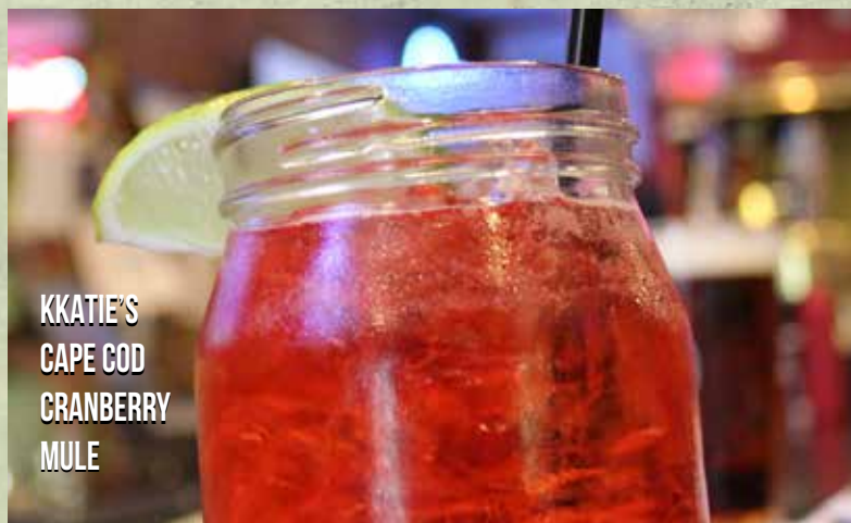
KKATIE'S CAPE COD CRANBERRY MULE

Locally distilled Nor'easter bourbon, sweetened with orange marmalade and luxardo cherries with a dash of walnut bitters.